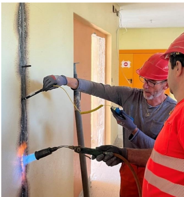
Heating of the bars and temperature control