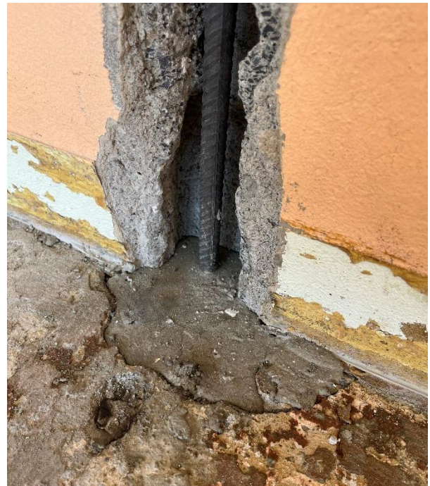
Mortar anchoring of re-bar in floor slab

re-bar is very interesting for this kind of structural reinforcement. It offers the possibility of a simple and targeted prestressing. There is no need for hydraulic equipment or major construction preparations. Everything was completed within five working days.