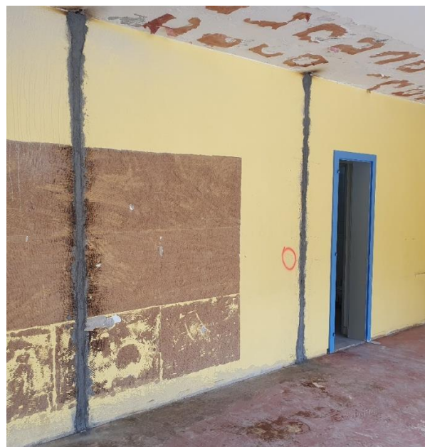
Final, mortared grooves