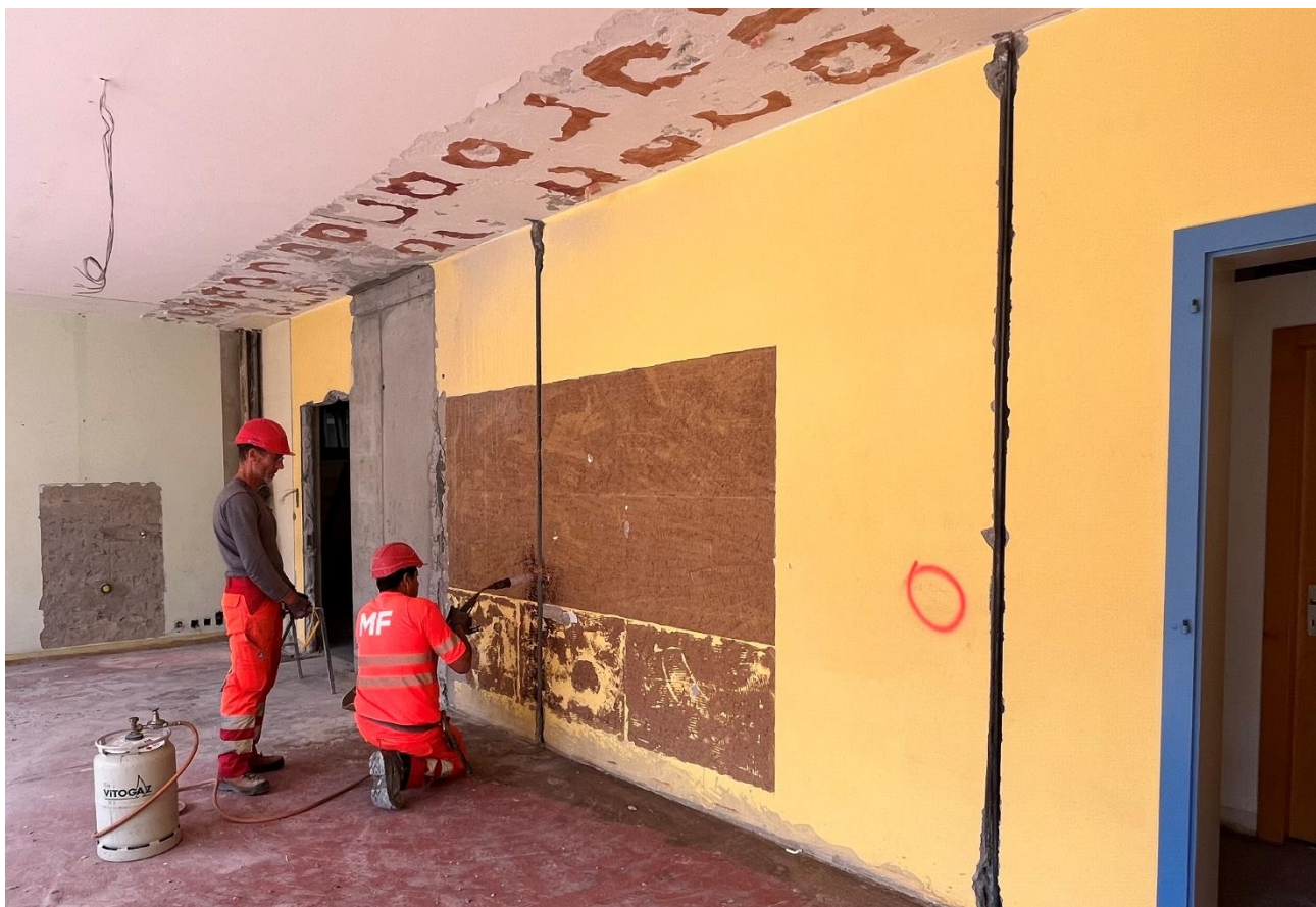
Heating/prestressing of re-bar 16