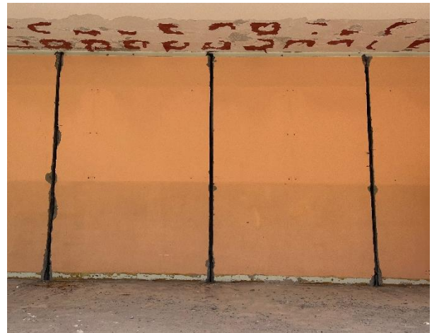
Cut grooves with anchored re-bars