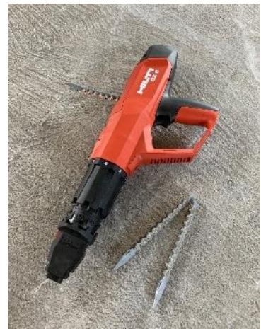
Hilti powder-actuated fastening tool