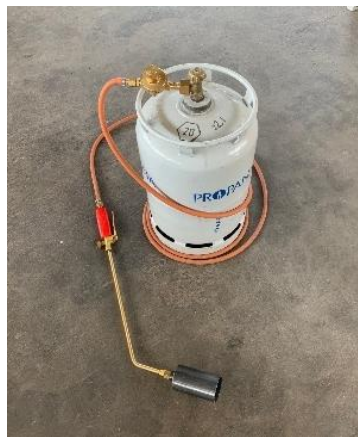
Heating device Gas