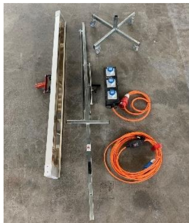
Heating device infrared