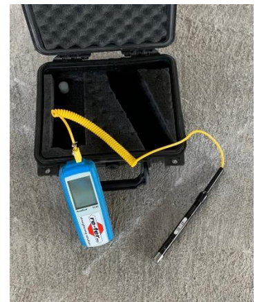
Temperature sensor with contact pin